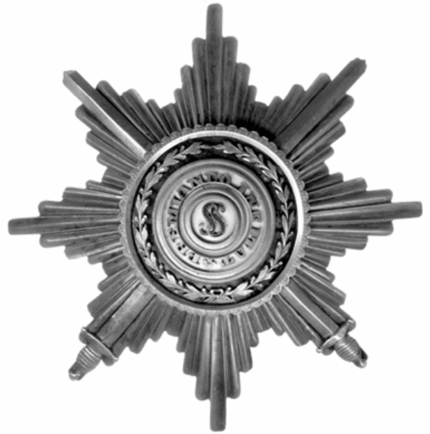
244 Order of St. Stanislaus , Military Division, an assembled or composite breast star, the silver rays of German style applied with Keibel-type silver-gilt swords, the central medallion of good quality, in silver-gilt and enamels with gold legend and wreath, silver backplate bearing the hallmark of M. Sokolov, 83 mm., good very fine £300-500